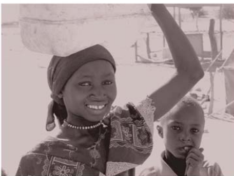
Darfurian Refugee Girls in Chad carrying water