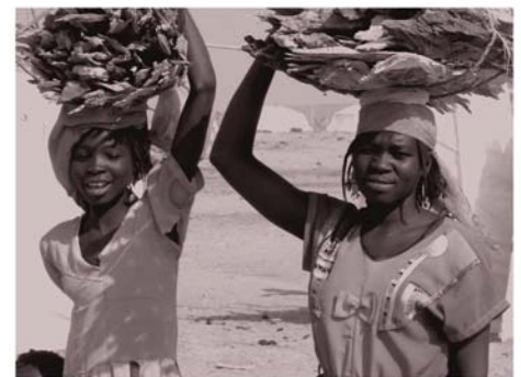
Darfurian Refugee Girls in Chad carrying firewood